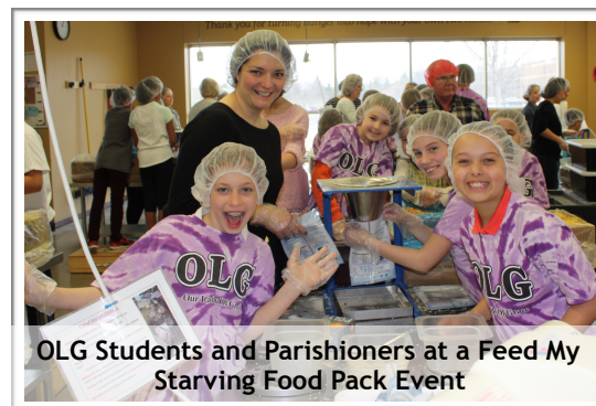
OLG Students and Parishioners at a Feed My Starving Food Pack Event

All of this is made possible by the countless hours our parents and teachers give to lead these important fundraisers and outreach projects! Thank You!