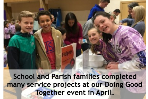
School and Parish families completed many service projects at our Doing Good Together event in April.

$7,000 - Actual estimated cost of educating each student in 2017-18