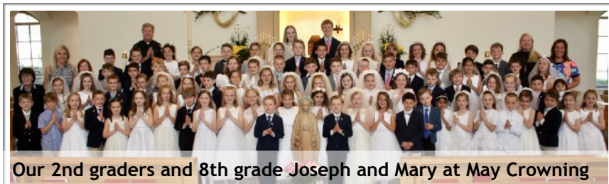
Our 2nd graders and 8th grade Joseph and Mary at May Crowning

Fostering a strong and growing relationship with Christ is the essence of what we do as a Catholic School. We are blessed to have three sacramental preparation programs through our school religion curriculum. This was our first ever school year having a Confirmation program in 8th grade!